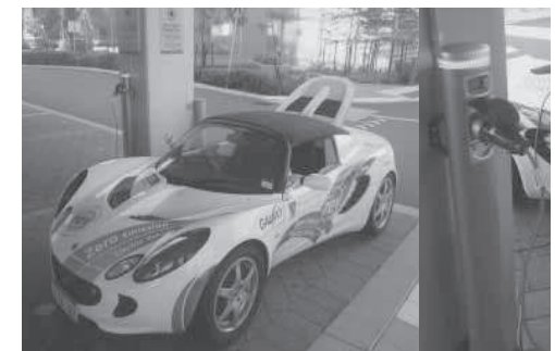
Left: The Lotus Elise charging-up at RAC Headquarters in West Perth; Right: WA's first Level-2 fast-charging station.