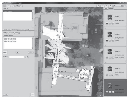
Robot mapping example

MAGIC 2010 was jointly coordinated and sponsored by the Australian and US Departments of Defence (DSTO and RDECOMM). Their goal was to encourage the development