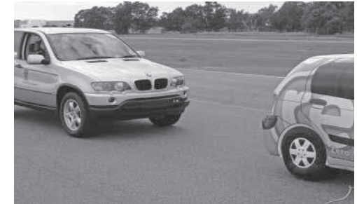
The BMW steer-by-wire in collision avoidance testing